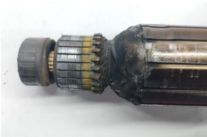
Obr.1 Poškodenie rotora